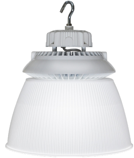
BAY (Shown with optional reflector)