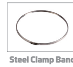
Steel Clamp Band